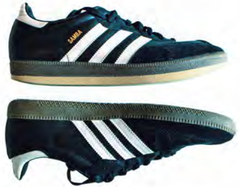
3 The Adidas Samba shoe model was modified with a rocker. Material properties of the modifications are EVA with SH 40A – SH 60A.

When talking about treatment objectives, terms like load, stress and load-bearing capacity come into play. Load, Stief explained, is the totality of all determinable influences, which have an external effect on structures or persons; Stress is the individual reaction of a structure or person, e.g. the load that is measurable by changing various physiological parameters. He introduced the participants to two typical types of stress: force and torque. “Nobody can see force, but it can be measured and you can tag the effects of forces as deformities or acceleration.” Load-bearing capacity is the highest load intensity up to which a structure or person can be loaded without incurring limitations, discomforts as well as reversible or irreversible damage.