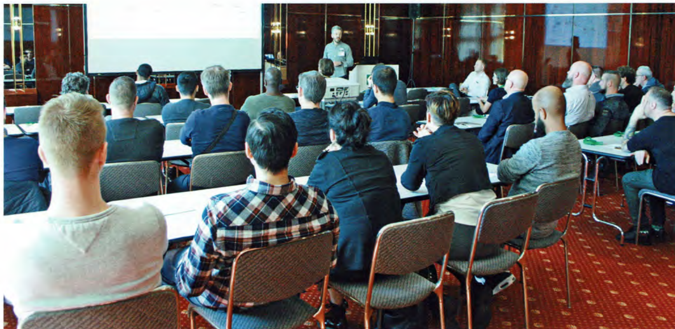
1 The seminar attracted an international audience and was fully booked.